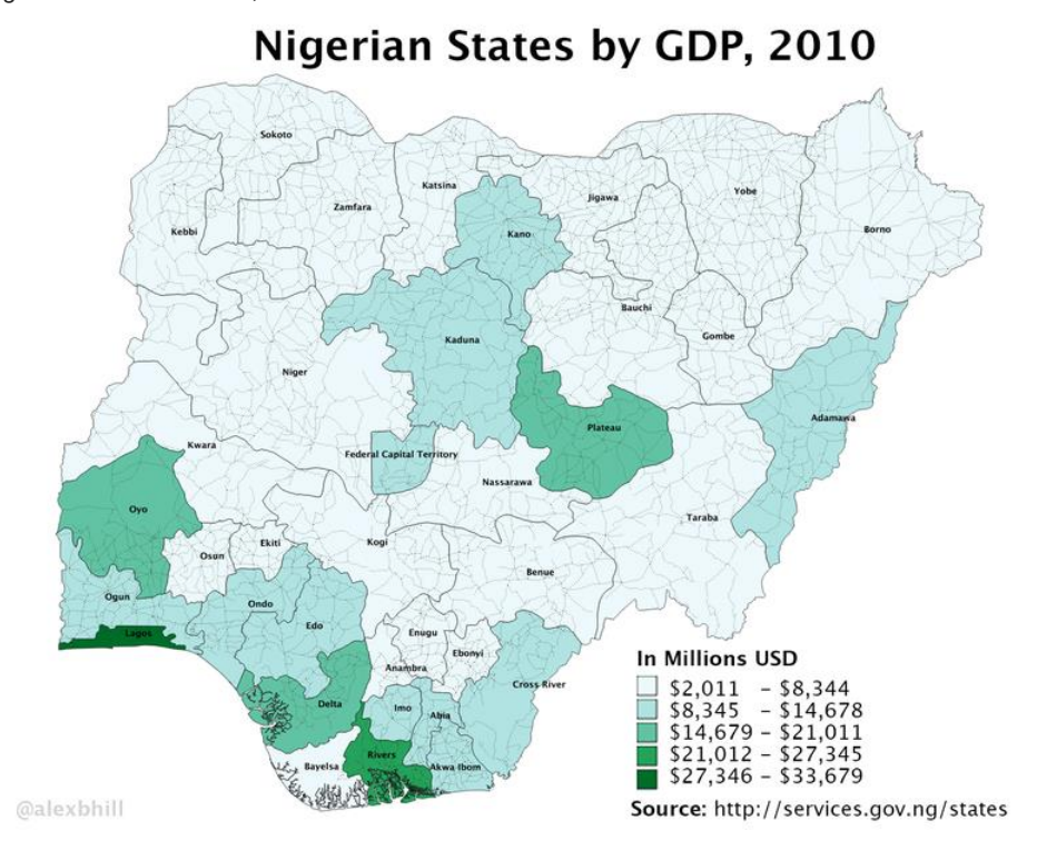
Figure 3: State level GDP, 2010

When designing an IGR policy for a given state, it is important to take into account the following factors: