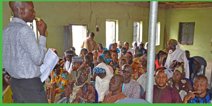
Carrying all citizens along in planning for the State is a novelty and an exciting experience. Ekiti and Osun States are leading this initiative in Southwest Nigeria.