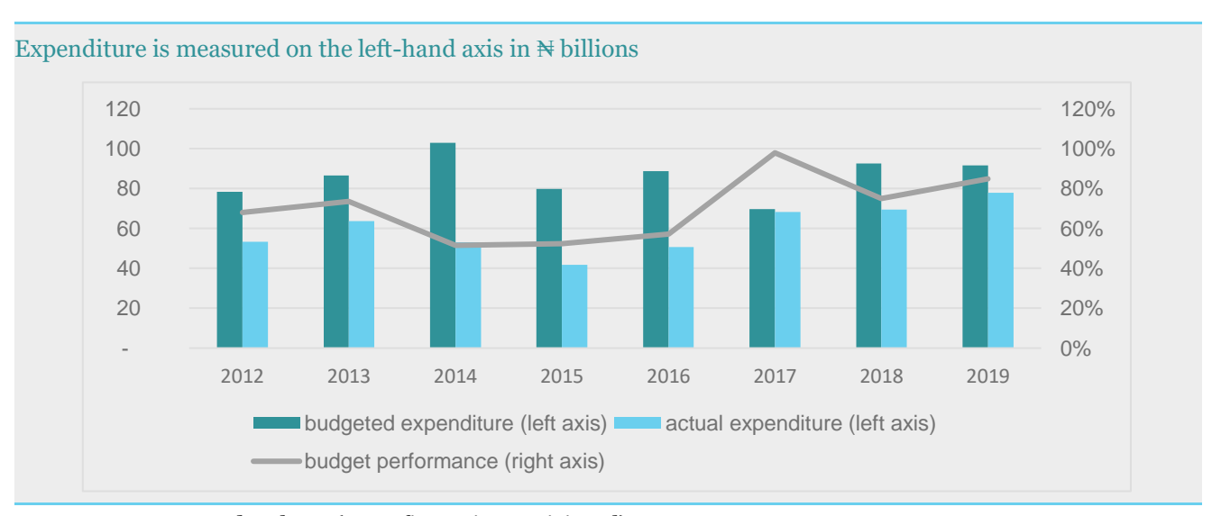
Figure 1: Budget performance in Yobe State 2012–2019